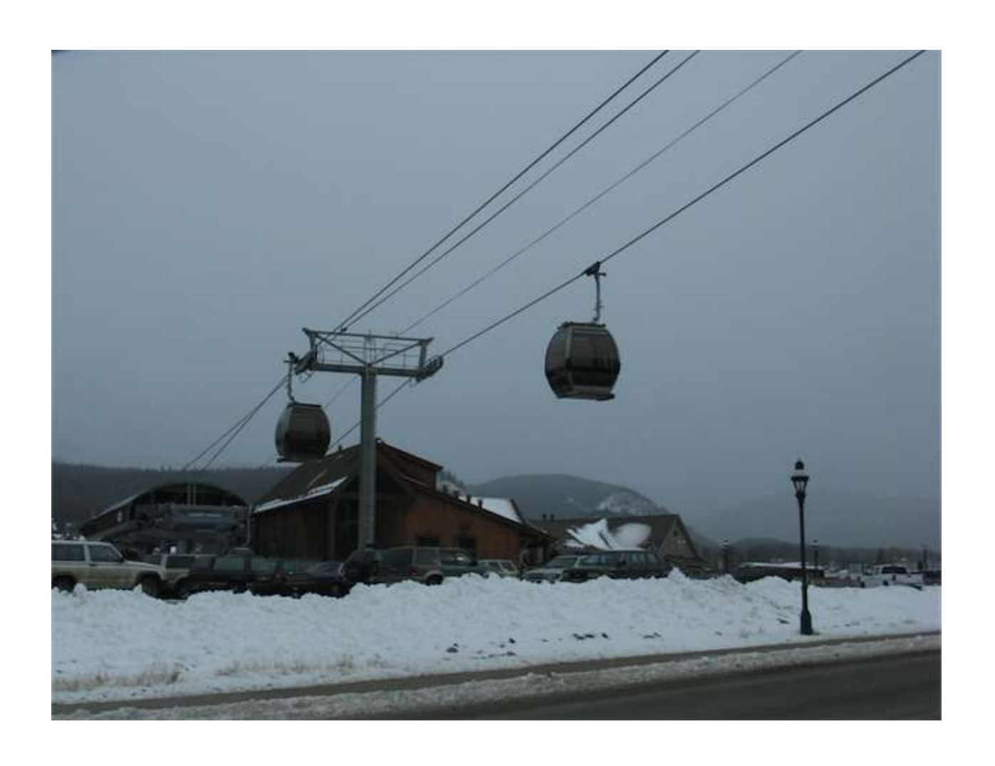
Sure, Breckenridge is a popular ski area.